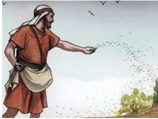
The Parable of The Sower

Through the course of the investigation, the team solved all of the parables, cleared Edmondo's name, and discovered that Agent Slim had a twin brother named Trim who had been causing all of the problems! After everything was cleared up, Agent Ace Liberty decided not to retire, and Director Rhodes agreed to let the team continue their work. The team and the kids all learned valuable lessons from the parables such as be merciful, rejoice, be prepared, help others, and be content. Everyone found the mysterious messages in the parables of Jesus!