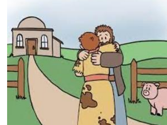
The Prodigal Son

Don't forget our Memory Verse: Matthew 7:28-29.