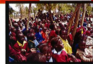
Students At Mt. Sinai Christian Academy